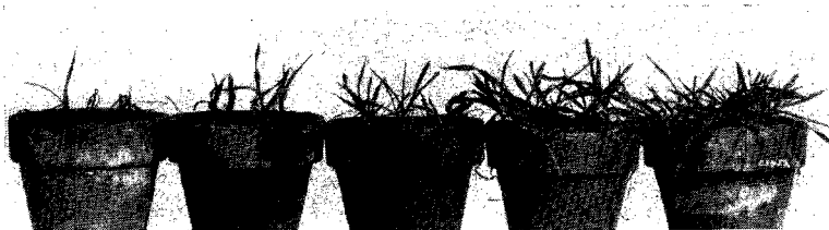
Fig. 5.—Varieties of rye artificially frozen in December, 1929. Left to right: Abruzzi, Rosen, Swedish, North Dakota No. 9, and Dakold.

On the average Dakold was injured the least, but the difference, as compared with North Dakota No. 9 and Swedish, was not great. In general North Dakota No. 9 ranked second, Swedish third, Rosen fourth and Abruzzi was the least resistant of all.