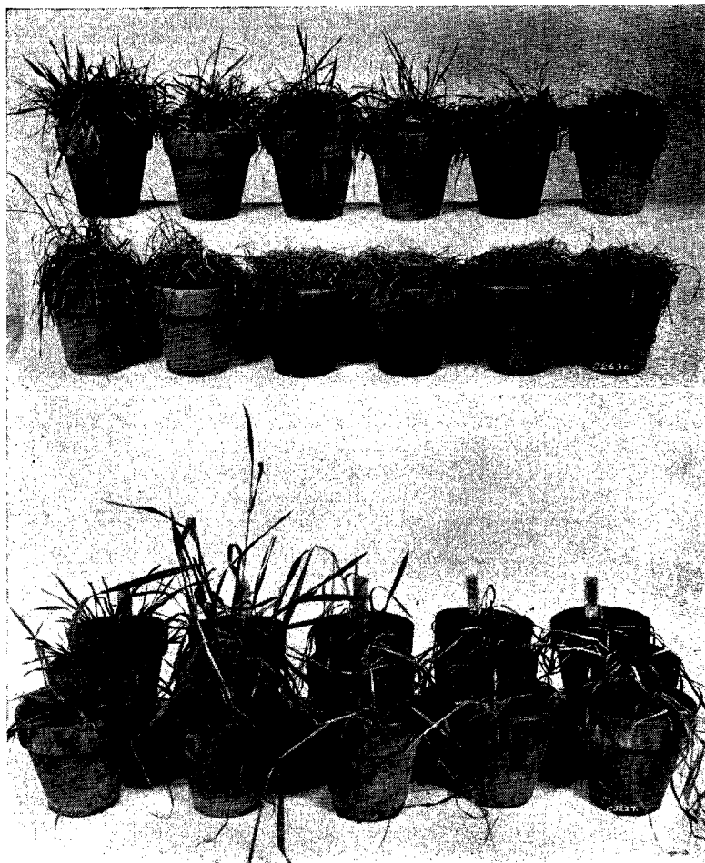
FIG. 1.—(Upper) Winter wheat frozen artificially. Top row, Kanred; second row, Blackhull. Frozen 6, 12, 15, 18, 21, and 24 hours, respectively.

(Lower) Hybrids and parents of the cross Dakold rye \times Chinese wheat frozen artificially. Left to right: Dakold rye, hardy hybrids, semihardy hybrids, tender hybrids, Chinese wheat.