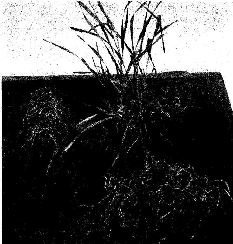
FIG. 3.—Winter wheat frozen artificially. Upper: Left, Kanred; right, Minturki. Lower: Blackhull.

The probable errors of the mean for the artificial-freezing tests in each case were found to be 2.1 and 2.7 per cent, respectively, and the correlation coefficients expressing the relation between injury