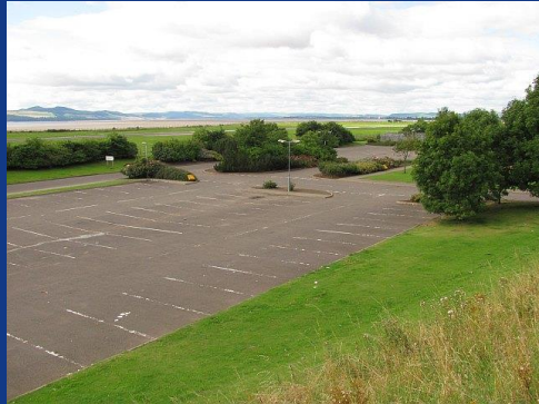
Self generated by local contacts