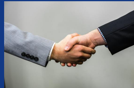
Site selection consultant for client