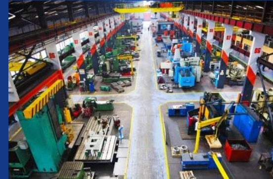
Existing business looking to expand or add new product line